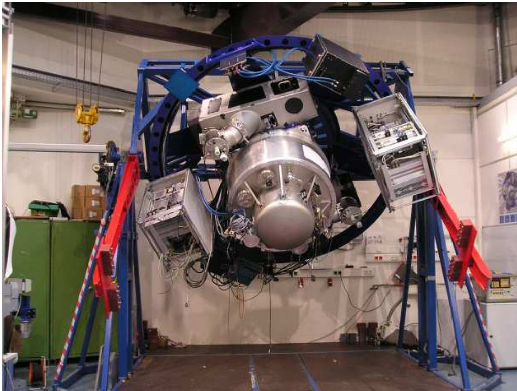
Fig. 1. X-Shooter mounted on the VLT telescope simulator at ESO.